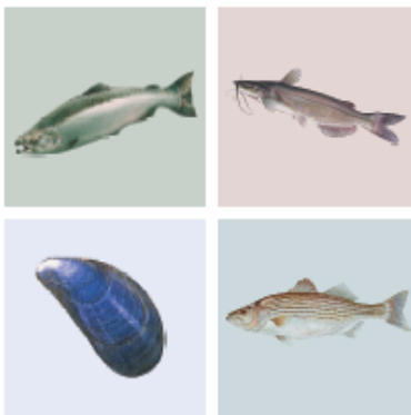
ALLIANCE FOR ENVIRONMENTAL INNOVATION A PROJECT OF ENVIRONMENTAL DEFENSE