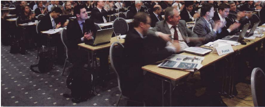
North Atlantic Seafood Conference